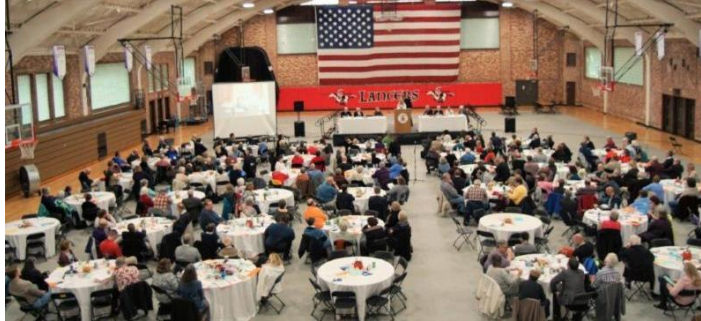
Scene from 2018 Diocesan Convention which met at St. John's NW Military Academy in Delafield

Nominations and Resolutions due August 19 th